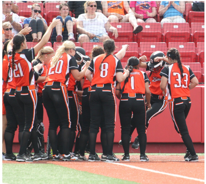
Early Bird Special (Before December 1, 2014)